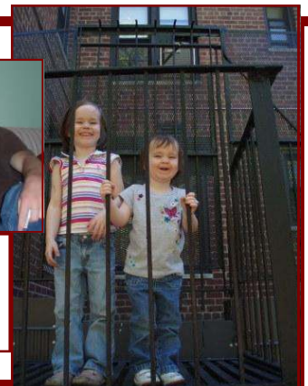
Our back yard jail (Right)

“That the Gentiles might glorify God for His mercy” Romans 15:9