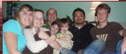
Home Bible study friends (Above)

We are thankful for all of the set up and take down help we have.